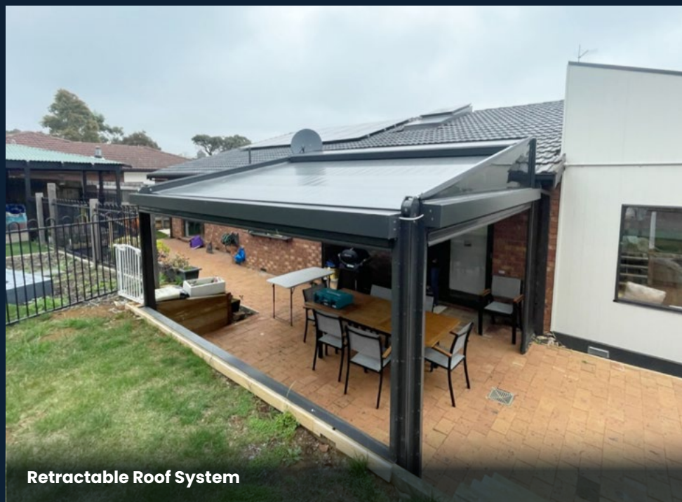
Retractable Roof System