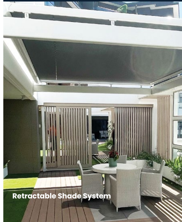
Retractable Shade System