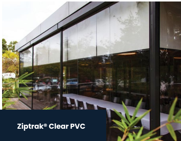
Ziptrak® Clear PVC