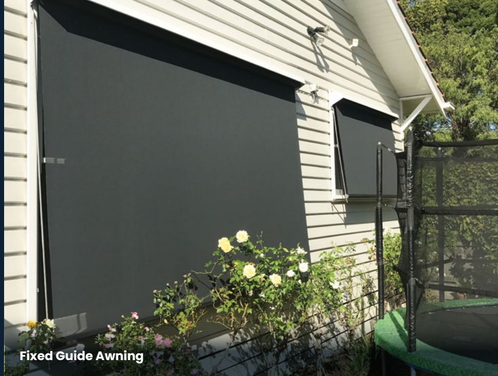
Fixed Guide Awning