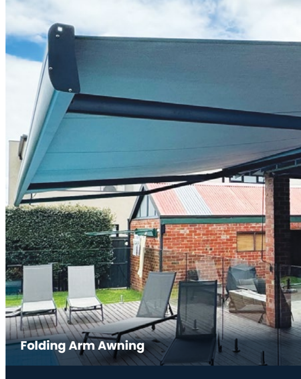
Folding Arm Awning

Similar to our Auto-arm awnings, Fixed Guide awnings travel up and down along a stainless-steel guide but are operated via remote control motors or by manual crank handle. Rather than pitching out on an auto-arm, the fixed guide awning is pitched via the stainless-steel fixing bracket at the bottom of the guide, with varying pitches from 50mm to 300mm.