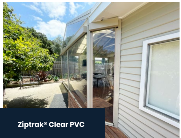
Ziptrak® Clear PVC