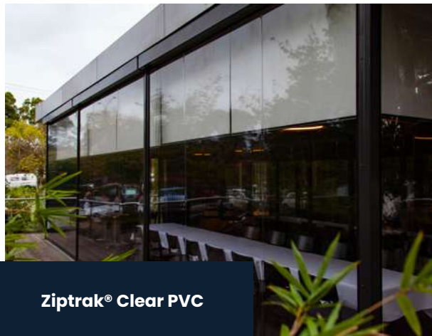
Ziptrak® Clear PVC