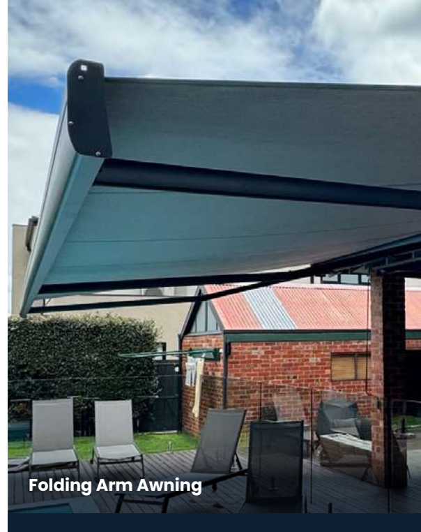
Folding Arm Awning

Similar to our Auto-arm awnings, Fixed Guide awnings travel up and down along a stainless-steel guide but are operated via remote control motors or by manual crank handle. Rather than pitching out on an auto-arm, the fixed guide awning is pitched via the stainless-steel fixing bracket at the bottom of the guide, with varying pitches from 50mm to 300mm.