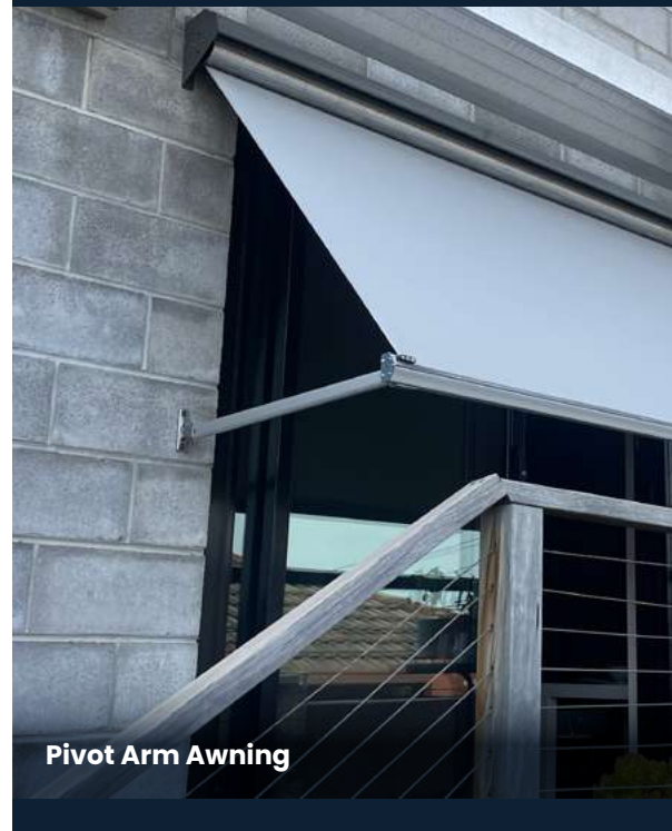
Pivot Arm Awning