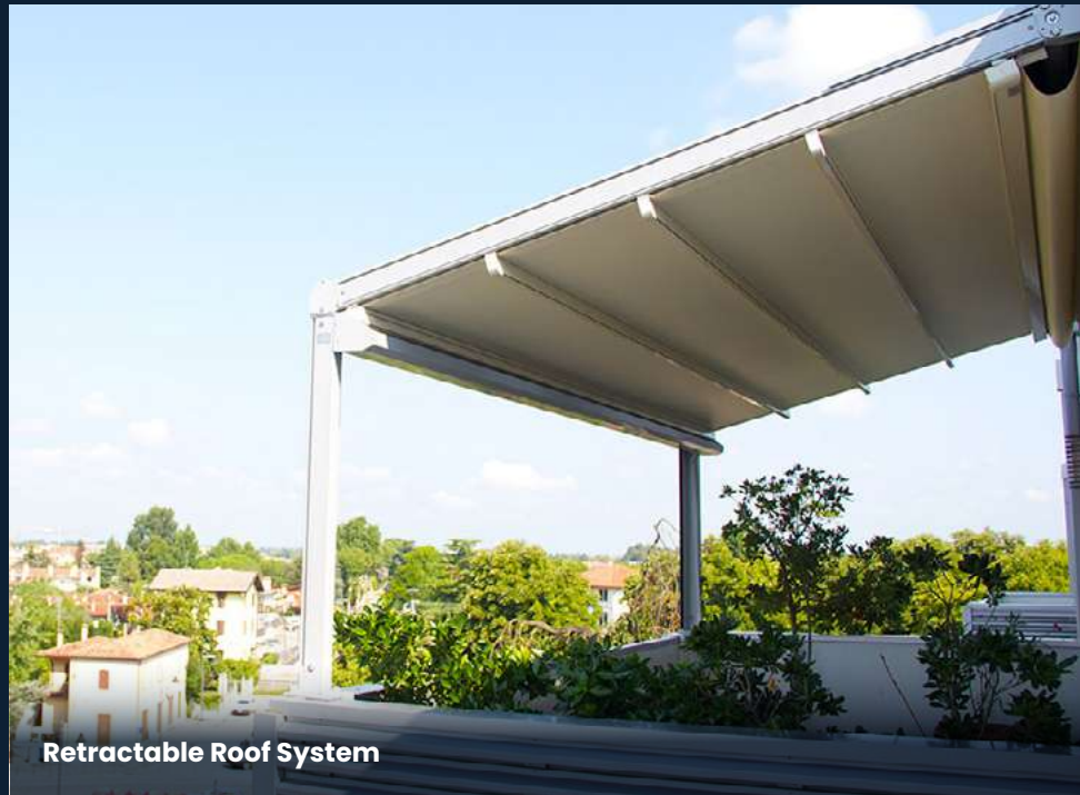
Retractable Roof System