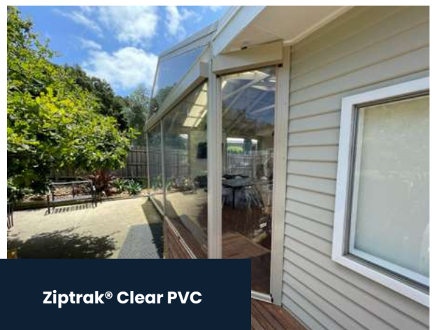
Ziptrak® Clear PVC