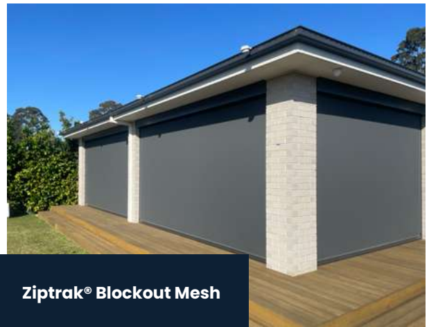
Ziptrak® Blockout Mesh