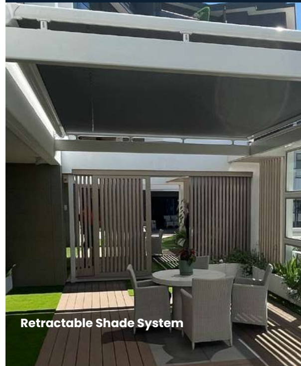
Retractable Shade System