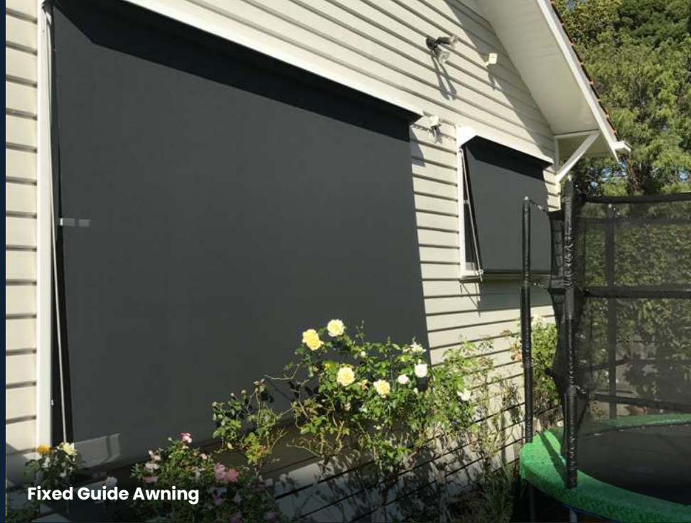
Fixed Guide Awning